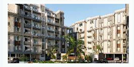
Site: Opp. American School, Ajwa Crossing (N.H.8), Vadodara,