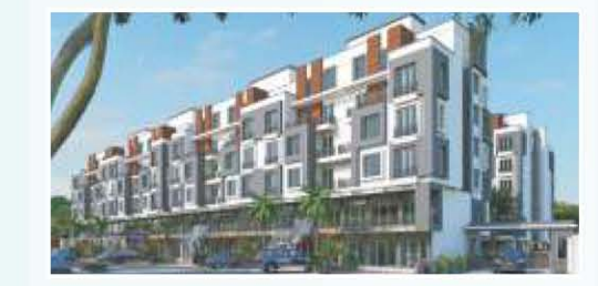
Site: Ajwa Main Road, Beside Sevakunj, Ajwa Crossing (NH 8), Vadodara.