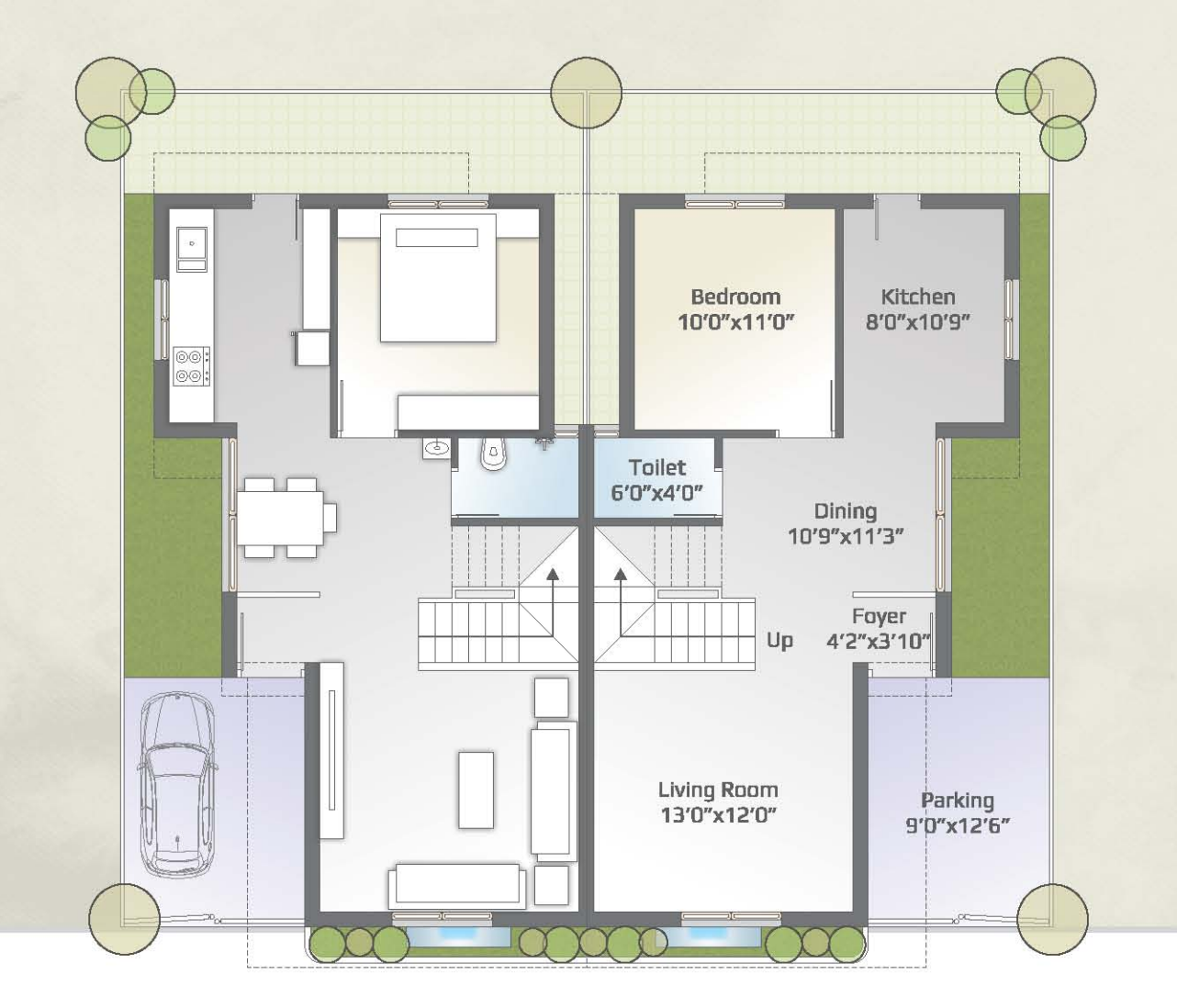
7.5 MTR. Wide Road